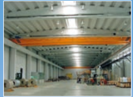
Alumil Aluminium Profiles Industry, Kilkis, Greece