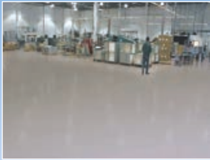
Romexpo Exhibition Center, Romania