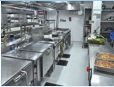
Intercontinental Aphrodite Hills Hotel, Cyprus