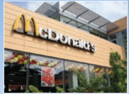
McDonald's, Tbilissi, Georgia