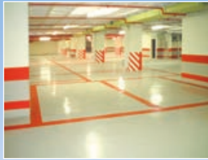
Russian Embassy, Marousi, Greece